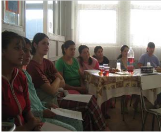
The mothers listen to a testimony from one of our volunteers who has two young boys. They were very touched and encouraged to hear this.

It has been a joy to see our new MOMs project getting off its feet. Our team of volunteers who run the program have been meeting weekly with mothers who are staying with their babies on the maternity floor.